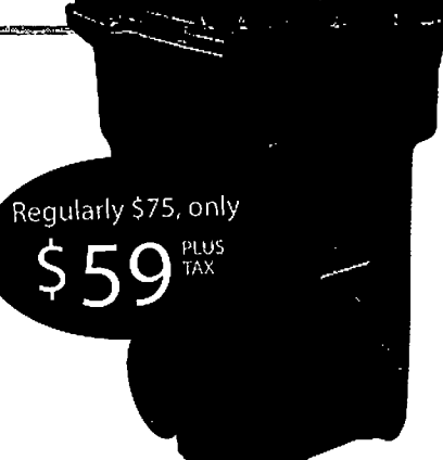
64 Gal, Green (trash) or Blue (recycle)