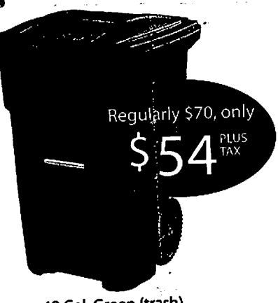
48 Gal. Green (trash) or Blue (recycle)